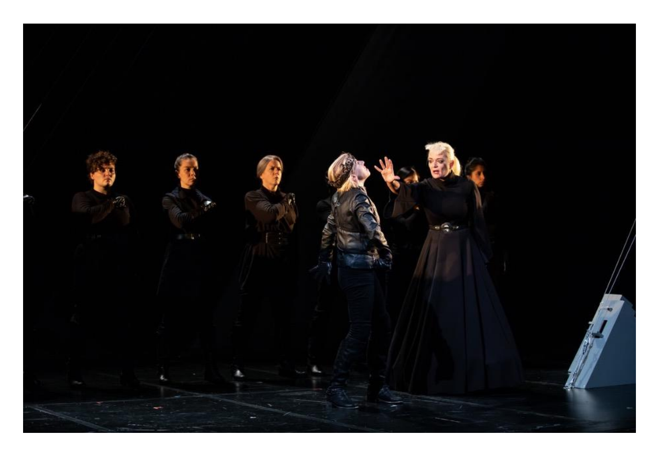
Figure 3. The cast of Richard III presented by Seattle Shakespeare Company and upstart crow collective.