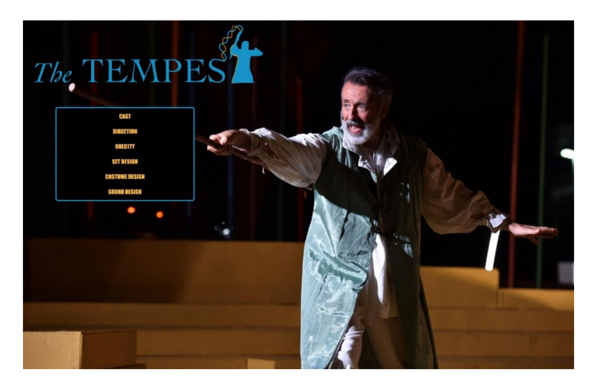
Figure 1. Screenshot from "Homepage." "The Tempest," Nashville Shakespeare Performance Archive, Fall 2019, shakespeare.belmont.edu/tempest/. Licensed under CC BY-NC-ND 4.0 (creativecommons.org/licenses/by-nc-nd/4.0/legalcode). No changes have been made to this image. Photo credit Malkin, Rick. Prospero. Nashville Shakespeare Festival, Nashville Tennessee.

element of the show. Each webpage features edited videos, photos, and copy text (Figure 1 and Figure 2). The end result is a set of pages added each year that highlight different elements of that year's production. The two classes are not "linked": students may take one or both if they choose, and in fact most students only enroll in one class.<sup>1</sup>