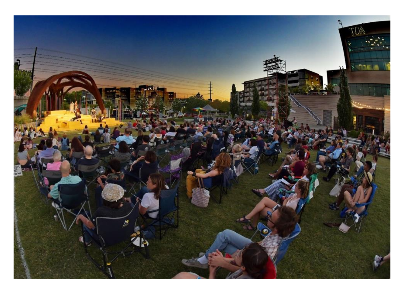
Figure 3. Photograph of The Tempest at ONEC1TY. Nashville Shakespeare Festival, Nashville, Tennessee.