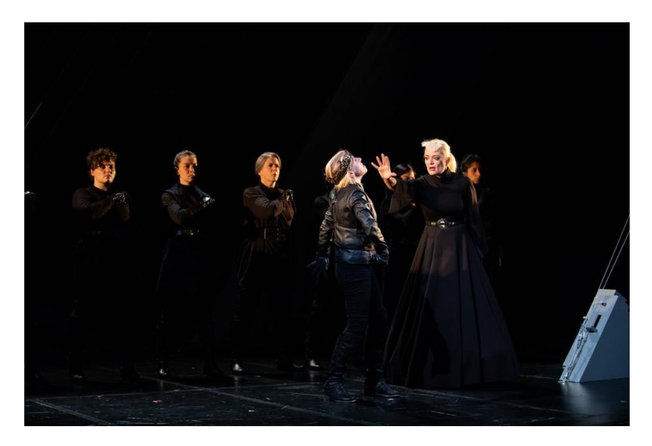
Figure 3. The cast of Richard III presented by Seattle Shakespeare Company and upstart crow collective.