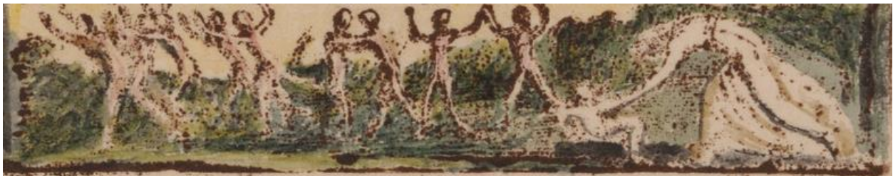
Figure 3. The image at the bottom of “The Chimney Sweeper” ( Songs of Innocence and of Experience , Copy L).

Chimney Sweeper and then to share it aloud often results in students voicing competing interpretations. 11 Highlighting this divergence of readings, I ask students to consider whether the possibility of a sinister reading of the image could undercut the apparently hopeful ending of the poem (which many students initially take at face value). Leading questions about the position of the image – which one of my students characterized as “squished down on the bottom” – can help them see how even the layout of Blake’s plates can carry meaning, here suggesting a parallel between the “confinement of the image” and the “social position of the chimney sweeps” (Leporati 95).