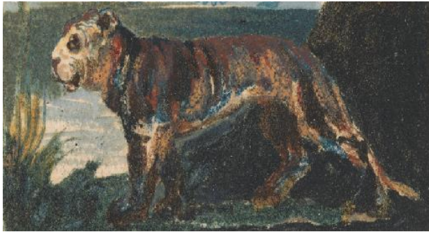
Figure 2. “The Tyger” ( Songs of Innocence and of Experience , Copy F). The illustration of the titular creature looks friendly, challenging the perspective of the poem’s speaker.

Elsewhere in Blake’s oeuvre , images function more straightforwardly. For instance, the scene that decorates the bottom of “The Chimney Sweeper” from Songs of Innocence ( Figure 3 ) appears to be an illustration of a sweeper’s dream recounted on lines 10-20, in which children are freed from “coffins of black” by an angel and rejoice on a “green plain” near a river (ll. 12, 15). Yet even this image may be read ironically: the figures of this scene appear to be dancing joyously, but they can also be interpreted as fighting. The blend of serene and sinister tones nicely complements the ironic text of the poem, in which an innocent (naïve) speaker celebrates the consolation provided to the working poor by promises of an afterlife. Though the exploited children of the poem are thereby comforted and encouraged to “do their duty,” both the poem and its companion piece in Songs of Experience clarify the extent to which such religious beliefs serve as tools for the ruling classes to keep the poor content with their miserable lives on earth. As I have discussed in an article in The CEA Critic , attention to Blake’s images enriches classroom discussions: asking students first to write down a description of the illustration of The