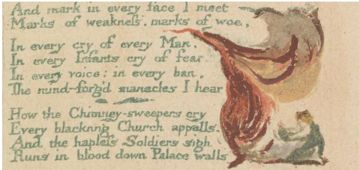
Figure 5. The fire in the margin of “London” ( Songs of Innocence and of Experience , Copy F).

The final step of this assignment is for students to gather together the preparatory steps after having revised each one separately. They then compose a paragraph that reflects on the relationship between text and image in general, based on what they have said about composite art, both from William Blake and their everyday messages. These conclusions become the basis for a class discussion near the end of the semester, and several interesting points emerge from these conversations.