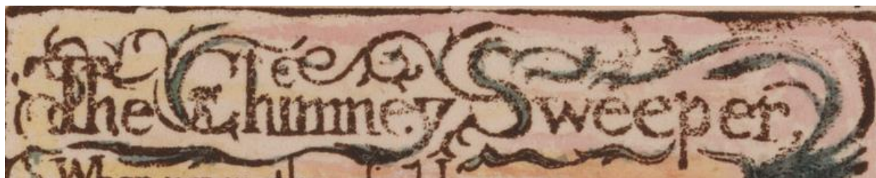
Figure 1. The title of William Blake's "The Chimney Sweeper" ( Songs of Innocence and of Experience, Copy L ). 4 Chimney sweeps appear in the letter C and above the letter P.

image working complexly in tandem to produce meaning. 3 Text and image cannot be fully separated in Blake's works, as they comment upon and modify each other's significance.